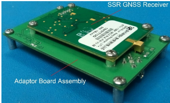
Adaptor Board Shown with standoffs

Introduction - Synergy's new, u-Blox based, SSR Series Adaptor Boards surpass the capability of the original M12 Series Adaptor Boards introduced in 2002.